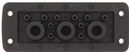
KES 13/24 10x Ø12 - 6.3mm 3x Ø16 - 20.5mm